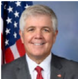
Cliff Bentz (R)